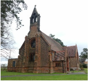
St Elizabeth's Church, Ashley (1880)