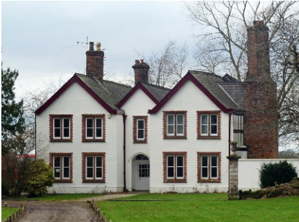
Ashley Hall was where the local gentry met in 1715 to decide whether to support the Hanoverians or the Stuarts. They chose the former. Although restored, it dates back to the 16th century.