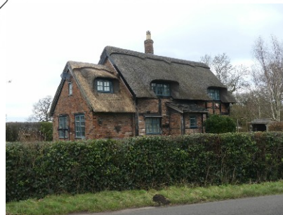
Broad Oak Cottage is a Grade II listed mid-17th-century thatched cottage near New Mills.